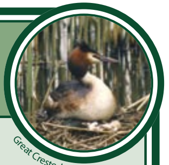
Great Crested Grebe

Northern Ireland wetlands are suffering every year from our increasing demand for tap water.