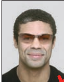
Unacceptable Dark tinted glasses and smiling