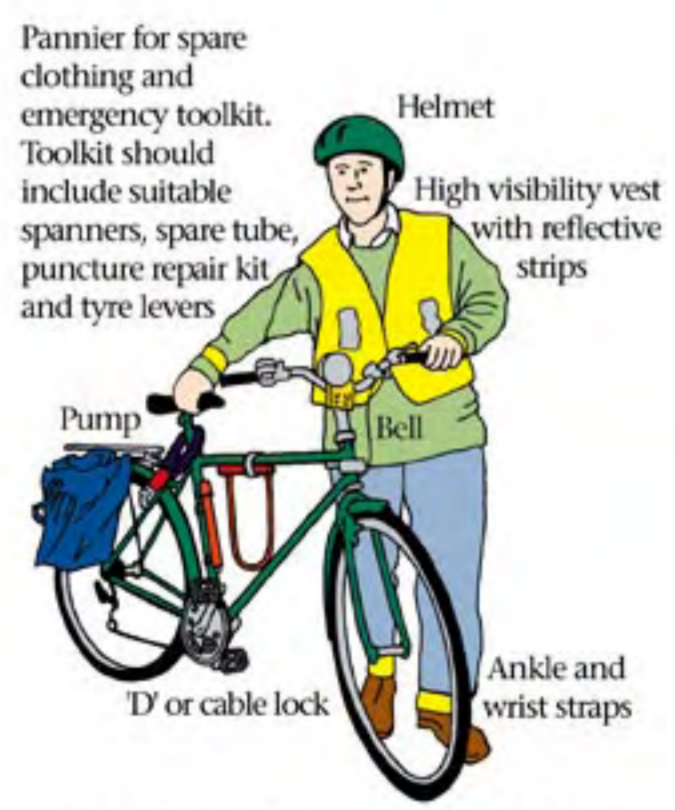
Cycling in dry weather