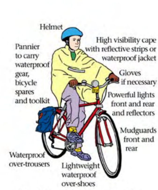
Cycling in wet weather